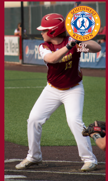
#00 Player Name 14-Year-Old

OFFICIAL EVENT PHOTOGRAPHY WILL BE SOLD PRE-SALE AND ONSITE BY PHOTOMULES.